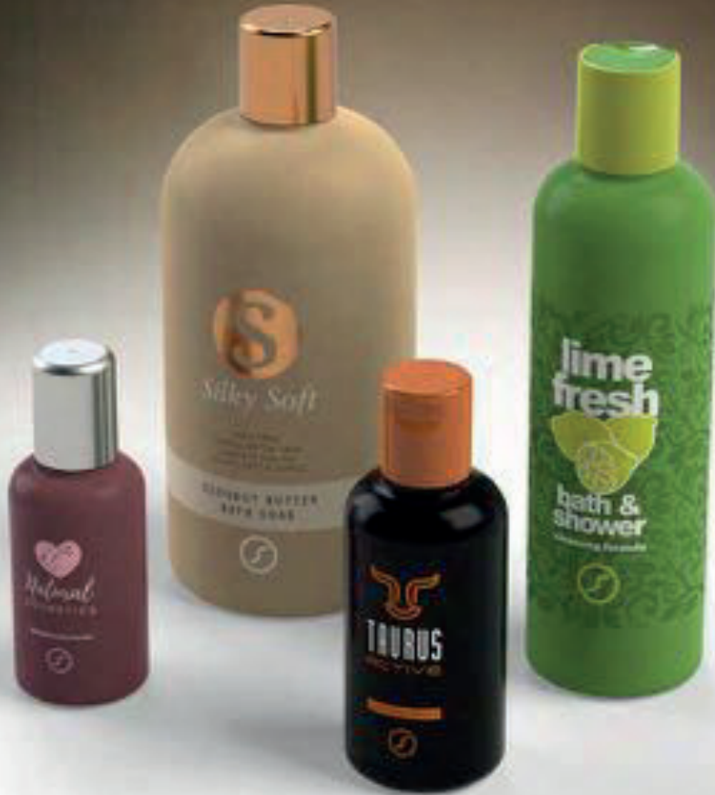
Left to right: 60ml Flat Based Boston Round (Ref: 6050) with Tall Radiused Cap (Ref: 3013), 500ml Standard Boston Round (Ref: 6052) with Shallow Cap (Ref: 3022), 100ml Standard Boston Round (Ref: 6061) with Flip Top Cap (Ref: 3018) and 250ml Tall Boston Round (Ref: 6001) with Disc Top Cap (Ref: 3033).

Ever popular with brands seeking a versatile packaging solution, our Boston rounds provide the perfect all-rounder for a host of market sectors. With standard, tall and flat based options available, these versatile designs are available in 50ml to 500ml capacity sizes.