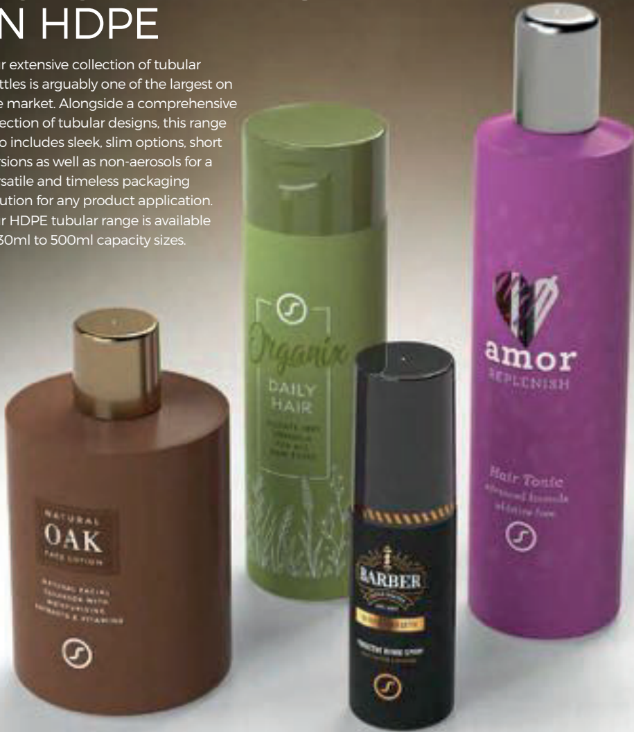
Left to right: 300ml Short Tubular (Ref: 6047) with Shallow Cap (Ref: 3005), 200ml Tubular (Ref: 6004) with Double Wall Flip Top Cap (Ref: 3038), 50ml Non Aerosol Tubular (Ref: 6002) with Non Aerosol Over Cap (Ref: 3009) and 300ml Tubular (Ref: 6046) with Tall Radiused Cap (Ref: 3011).

Our extensive collection of tubular bottles is arguably one of the largest on the market. Alongside a comprehensive selection of tubular designs, this range also includes sleek, slim options, short versions as well as non-aerosols for a versatile and timeless packaging solution for any product application. Our HDPE tubular range is available in 30ml to 500ml capacity sizes.